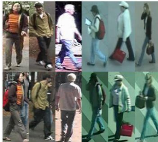
Fig. 1 - Samples of different pedestrians captured by two cameras on the VIPeR (Gray et al, 2007) and PRID2011 (Hirzer et al, 2011) datasets. First row is camera A and second row is camera B. Each column indicate the images of the same person.

The method is shown in figure 2; a convolutional neural network is used to obtain a filter that represent a region salient in the image. This filter is combined with other salient map obtained from FqSD algorithm. Finally, a final salient map is used to weight the information in a person image.