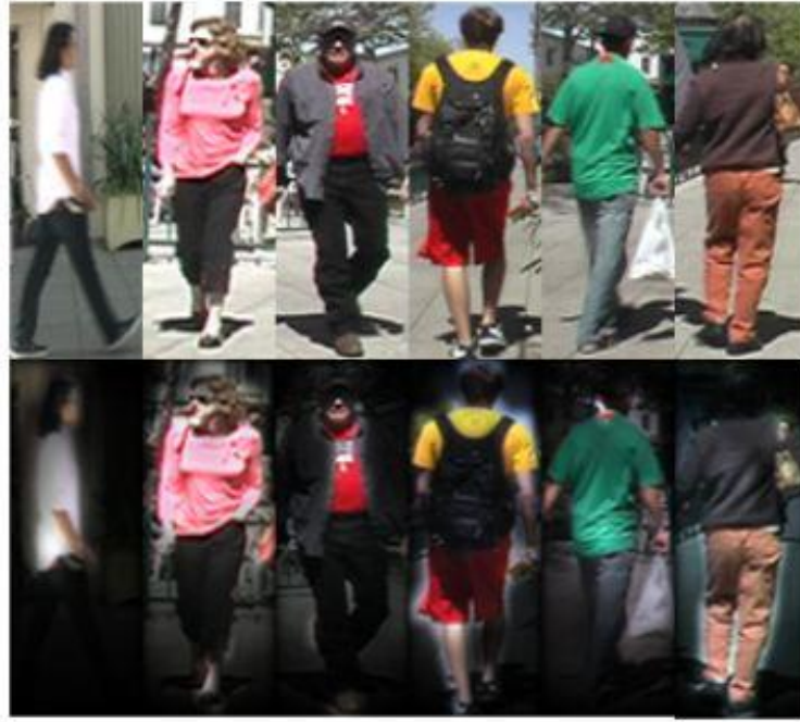
Fig. 3. Visual samples of the WPI in the second row and in the first row the original person image.